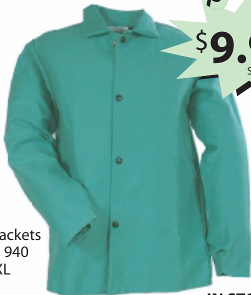
30" Jackets COM 940 M-4XL